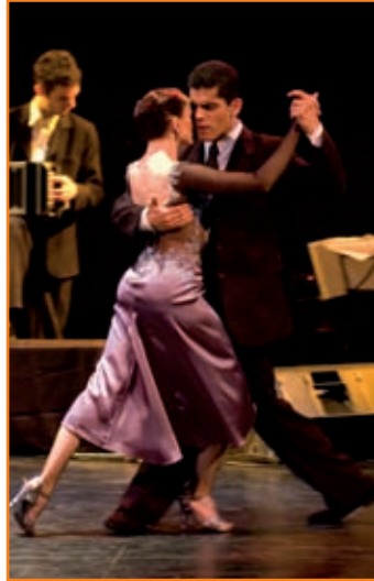
Ma Ville est Tango [My Town is Tango]