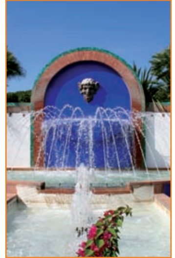
Journées Méditerranéennes du Jardin [Mediterranean Garden Days]