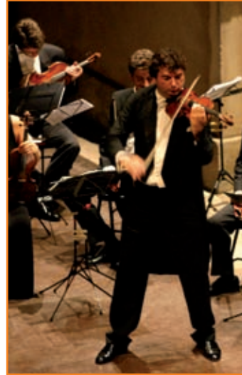
Festival de Musique [Music Festival]