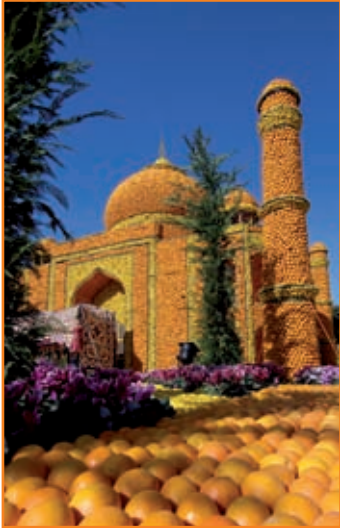
Fête du Citron [Lemon Festival]*